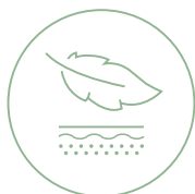
Gentle on the skin

In addition, Tencel® fibres are extremely colourfast, robust, breathable, skin-friendly, resistant to dust mites and bacteria and fully biodegradable.