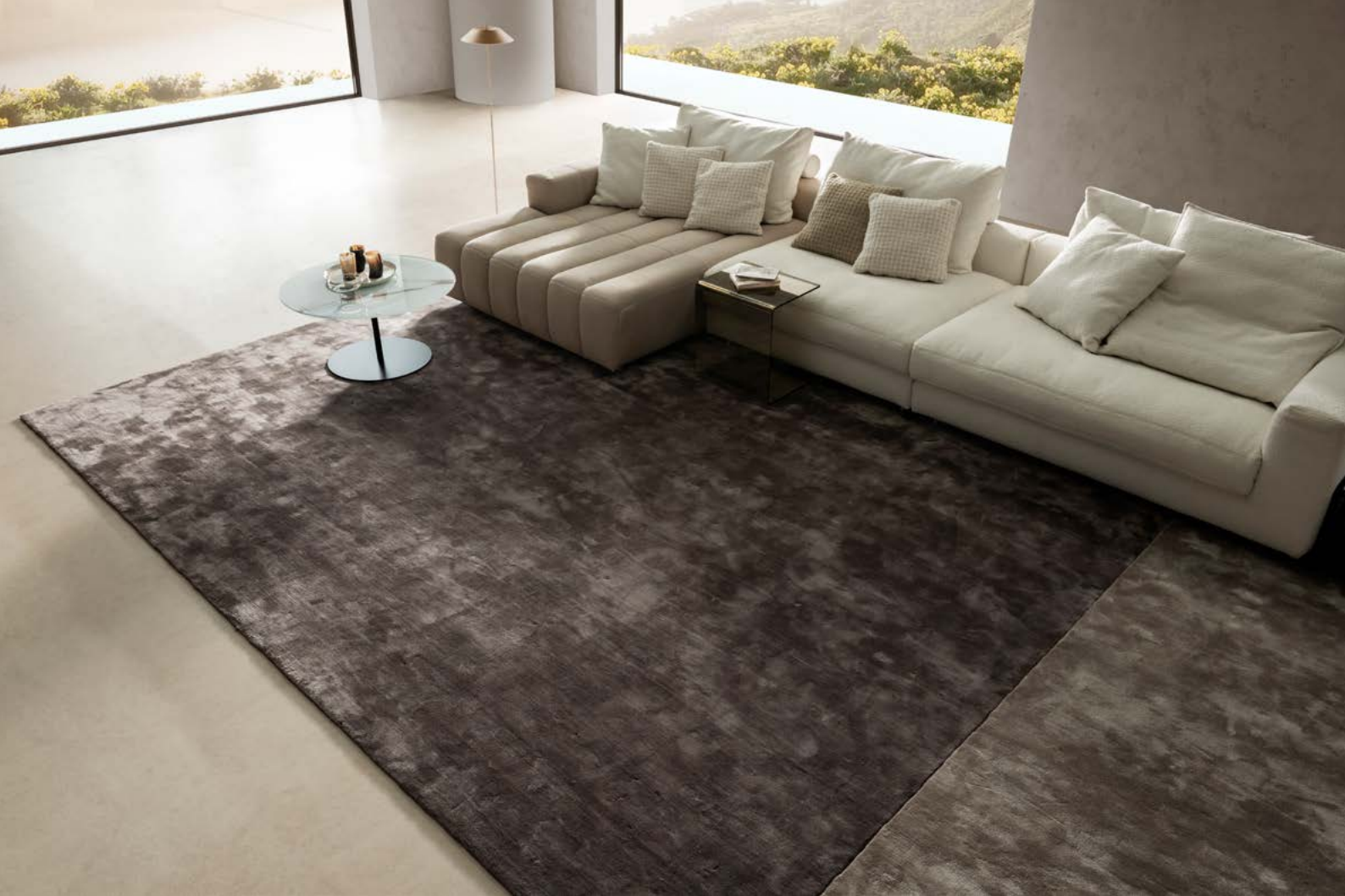
Model: Rug „Sense“, 157.48x157.48 in and 39.37x157.48 in Colour: Graphit (left) and Silver (right)