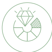
High level of colour fastness